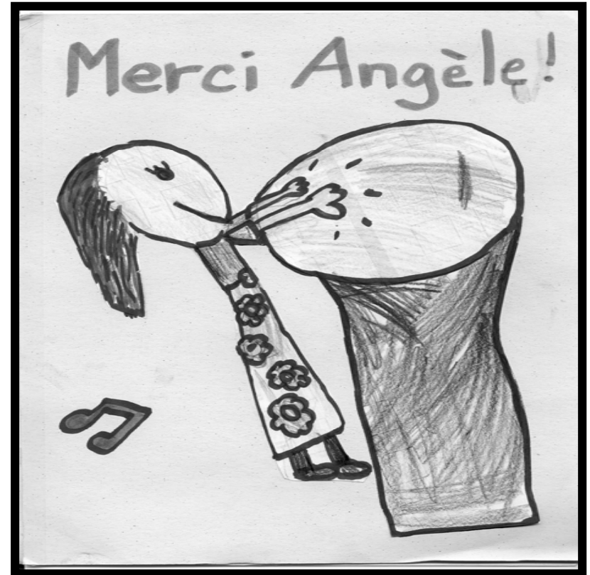
Art-work by 10 year old drummer/ participant School District #23

“If you can sing the rhythm you can play the rhythm!”